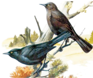
© GOVERNMENT OF NL BY ROGER TORY PETERSON

The Rusty Blackbird is medium-sized (21-25 cm), with yellow eyes and a narrow pointed bill. Males are glossy black with a greenish tinge and females are dark grey-brown. They have black legs and feet and a rounded tail. Its song is a high pitched “kerglees” and sounds like a creaky hinged door.